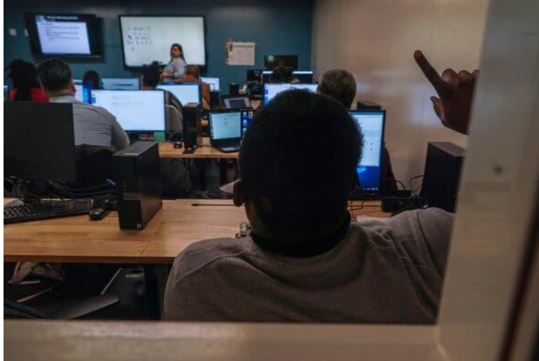
The comprehensive job training approach has been honed by nonprofits like this one from Per Scholas in the Bronx.

To streamline such work, the Center for Workforce and Economic Opportunity at the Federal Reserve Bank of Atlanta is building metro area websites and developing programs to help career coaches across the country pinpoint local job openings and relevant training. The websites rely on data from Emsi and Burning Glass Technologies , labor market research firms.